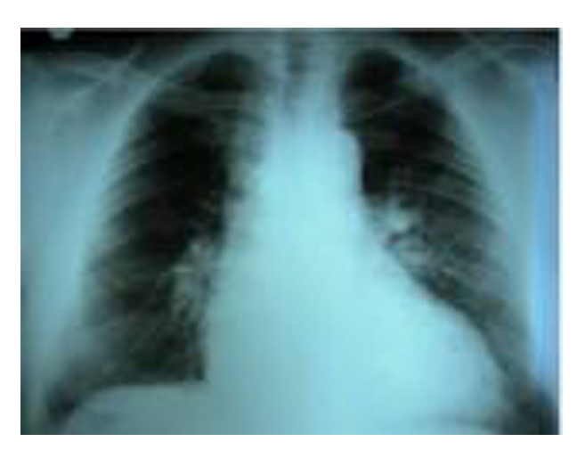
Figure 1 Cardiomegaly and dilatation of right and left lung hilum. Increased vascular shadowing in both sides. Costophrenic regions free of pleural effusion.

Transthoracic echocardiography was the initial diagnostic tool that demonstrated enlarged right heart cavities with normal sized left ventricle, paradoxical movement of interventricular septum, and severe pulmonary hypertension