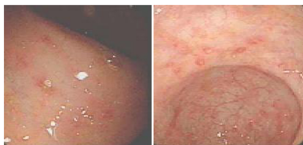
Figure 1 Colonoscopic picture showing aphthoid-like ulcers, granularity, and pin-point ulceration with fibrin deposits.

S. stercoralis is an intestinal nematode of humans. Although most infected individuals are asymptomatic, 19,20 S. stercoralis is capable of causing a fulminant illness that is often fatal if not recognized and treated. This is seen in certain conditions associated with a decrease in host immunity, including immunosuppressive therapy (particularly the use of glucocorticoids), hematological malignancies, bone marrow and renal transplants, human T-cell lymphotropic virus