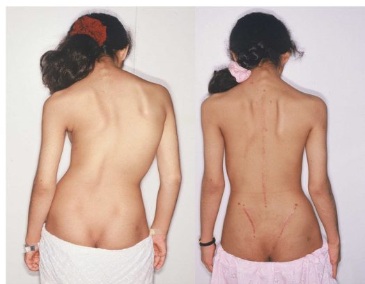
Figure 3 Thirteen-year-old female before and after correction and fusion with posterior iliac crest grafting.

and functional outcome using Spearman's rank correlation. A P -value of less than 0.05 was taken to be significant.