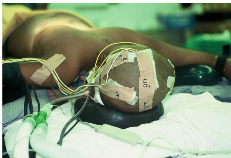
Figure 2 Setup for intraoperative somatosensory evoked potentials monitoring, which involves stimulating electrodes attached to the feet and recording electrodes on the scalp.

The data was analyzed using SPSS (SPSS version 14.0; IBM, Armonk, NY). Analyses were performed for correlations between the Cobb angle, percentage improvement,