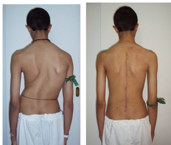
Figure 4 Fourteen-year-old boy after posterior correction and fusion using local bone.

There was a positive correlation between a high preoperative Cobb angle and subsequent improvement in postoperative mental and functional scores. Patients with large Cobb