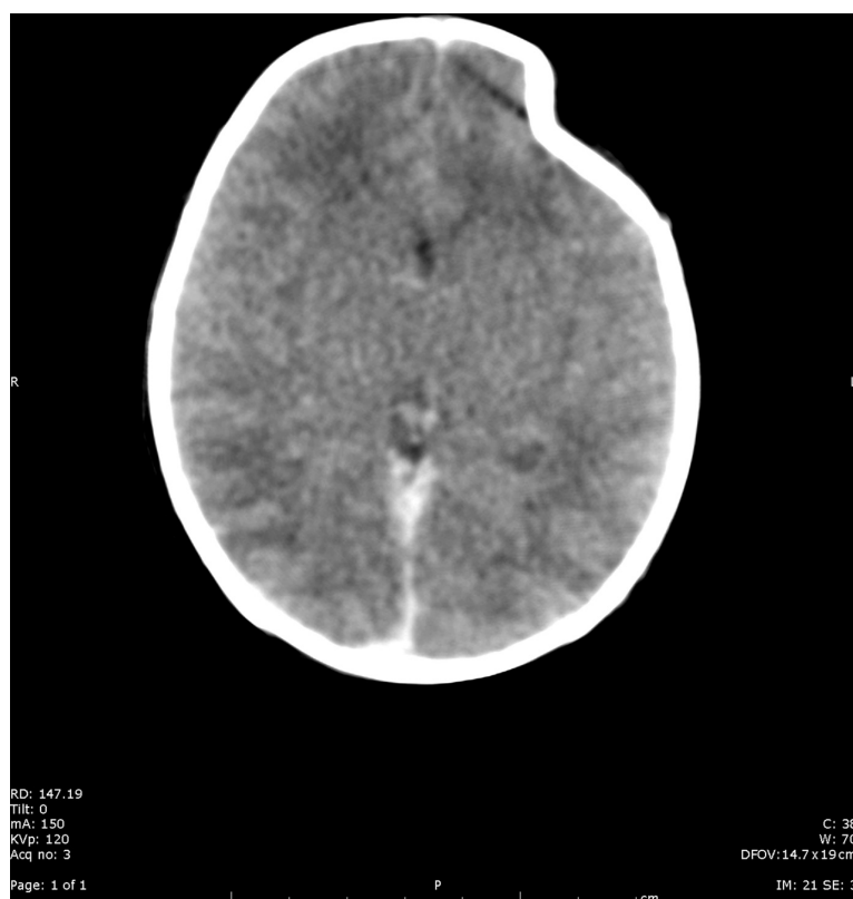
Figure 2 Preoperative computed tomographic scan of depressed fracture.

Congenital skull fractures have been described in the literature in association with trauma, Ehlers-Danlos syndrome, multiple gestations, and maternal or fetal masses. 1-4 Depressed skull fractures associated with birth trauma are most often