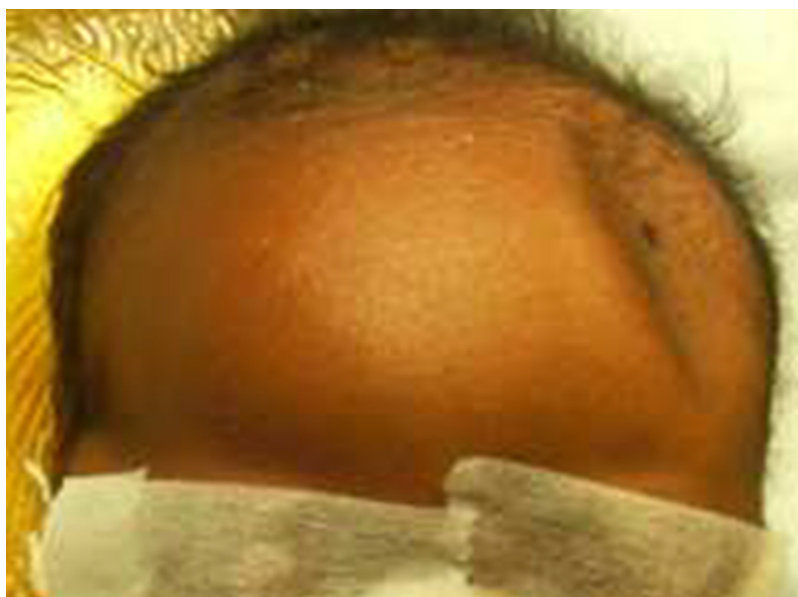
Figure 1 Preoperative photograph of depressed fracture.

The infant recovered from surgery uneventfully and was noted to have an improved cosmetic result on follow-up at 5 weeks and at 3 and 7 months. At the most recent follow-up, the infant was found to be neurologically intact and achieving all developmental milestones.