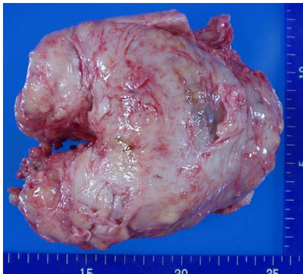
Figure 4 The enucleated specimen was 13 × 11 × 6 cm in size and weighed 475 g.

therapies. They include holmium laser enucleation of the prostate, transurethral electrovaporization of the prostate, transurethral microwave thermotherapy, and others. 3 However, these techniques are also performed for patients with slightly to moderately enlarged prostates. Rocco et al stated that 100 g is regarded as the limit of weight for those minimally invasive procedures. 4 European Association of Urology guidelines also show that open prostatectomy is the treatment of choice for large prostatic glands more than 80–100 mL 5 in size.