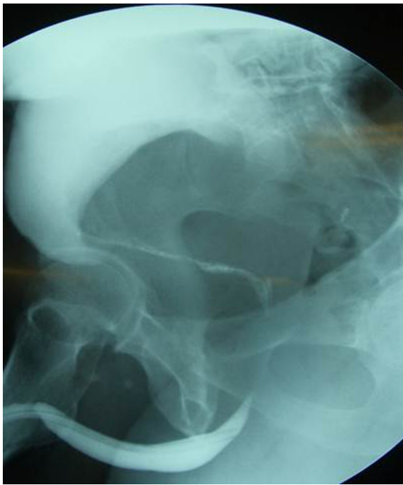
Figure 3 Vesicourethrography showed a prolonged and narrow prostatic urethra.

therapies. They include holmium laser enucleation of the prostate, transurethral electrovaporization of the prostate, transurethral microwave thermotherapy, and others. 3 However, these techniques are also performed for patients with slightly to moderately enlarged prostates. Rocco et al stated that 100 g is regarded as the limit of weight for those minimally invasive procedures. 4 European Association of Urology guidelines also show that open prostatectomy is the treatment of choice for large prostatic glands more than 80–100 mL 5 in size.