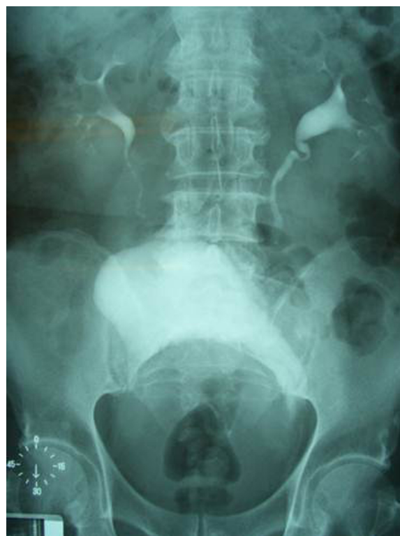
Figure 2 Drip-infusion pyelography demonstrated normal upper urinary tract with a huge shadow defect of the urinary bladder.