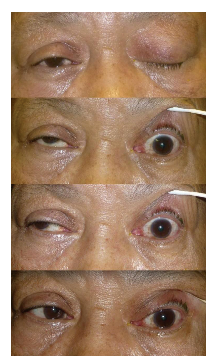
Figure 2 Complete ptosis and ophthalmoplegia in the left eye.

Ophthalmologic evaluation disclosed complete ptosis and ophthalmoplegia in the left eye, with the eye in central position (Figure 2). Proptosis was not noted. Visual acuity was 20/25 in the right eye and 20/50 in the left eye. Both pupils were equal, round, and reactive to light. Intraocular pressures were normal. Ophthalmoscopy revealed a slightly edematous left optic nerve, but no engorgement or tortuosity of the retinal vasculature. Ophthalmologic findings were consistent with a partial third, and complete fourth and sixth nerve paresis with hypoesthesia in the ophthalmic and maxillary distributions of the left trigeminal nerve. A subsequent MRI performed 3 days after the initial MRI disclosed a lesion in the left superior orbital fissure with