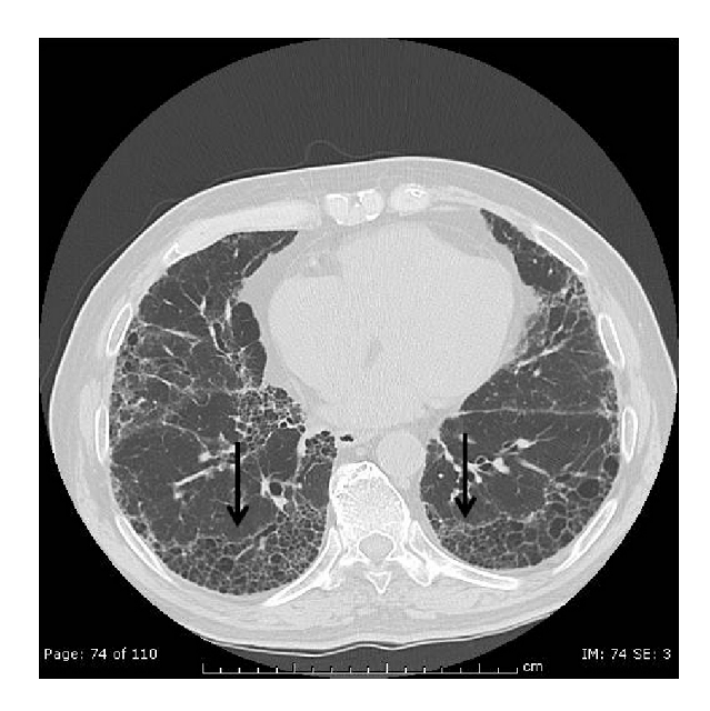
Figure I High-resolution computed tomography image demonstrating usual interstitial pneumonia pattern, with bilateral, basal, and subpleural predominant reticular abnormality and honeycombing (arrows).

found in several clinical settings, including collagen vascular disease, drug toxicity, chronic hypersensitivity pneumonitis, asbestosis, familial IPF, and Hermansky-Pudlak syndrome.<sup>1</sup> Therefore, the diagnosis of IPF requires exclusion of all known causes of fibrotic interstitial pneumonia.