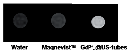
Figure 2 T_1 -weighted magnetic resonance imaging (MRI) phantoms of the \text{Gd}^{3+}_n\text{@US-tubes} solution at a 0.04 mM ( \text{Gd}^{3+} ). For comparative purposes, MRI phantoms of Magnevist™ at a 0.04 mM ( \text{Gd}^{3+} ) and pure water are also shown. All data were collected using a 1.5T Philips MRI imager.

Representative T_1 -weighted MRI images of the vials are shown in Figure 2. At 0.04 mM ( \text{Gd}^{3+} ) the gadonanotubes showed extremely large signal enhancement compared to Magnevist™ (ca. 100 times!) at the same concentration (Figures 2 and 3).