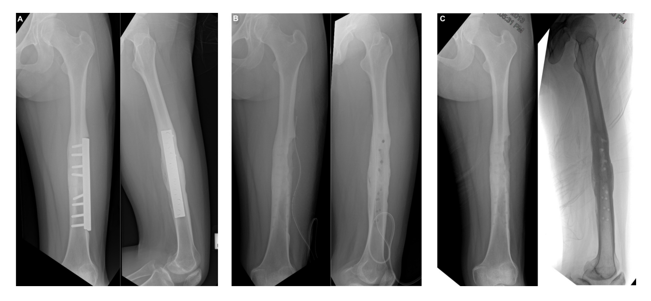
Figure 4 Chronic osteomyelitis associated with plating of femur, 2 year history of discharging sinus over lateral aspect of left thigh. Notes: (A) Healed fracture of left femur with lucency around the plate. (B) Immediate postoperative radiograph showing extent of sequestrate excised from under the plate and bone debrided along with infected granulation tissue. (C) Six weeks after surgery and anti-microbial therapy.

The vascularized bone graft offers certain advantages, including providing autogenous corticocancellous grafts with intact blood supply. The process of their incorporation is different from avascular grafts, such that there is no necrosis or resorption. The mass, architecture, and biomechanical strength of the vascularized graft is maintained, and they also have ability to hypertrophy.<sup>61</sup> These can be obtained from the fibula, iliac crest, and ribs and transferred with skin, fascia, and muscle to fill soft-tissue defects. The success rate of vascularized fibular grafts has been reported to be between 77% and 90%.<sup>63,66-68</sup> Complications with the use of vascularized bone grafts include failure of the anastomosis, fracture of the graft, and donor-site morbidity.