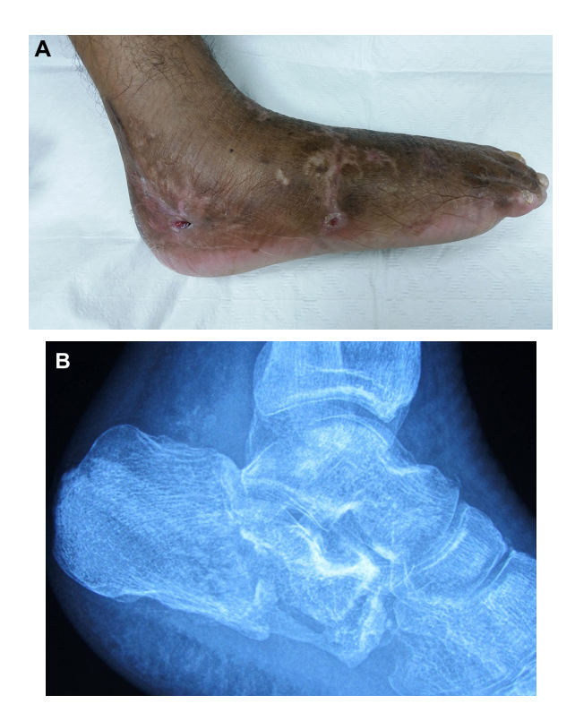
Figure I Typical discharging sinus over lateral aspect of heel ({\bf A}) from underlying chronic osteomyelitis of the calcaneum ({\bf B}) following an open fracture.

Certain features like persistent sinus tracts (Figure 1), exposed bone, chronic wound over a fracture site or surgical