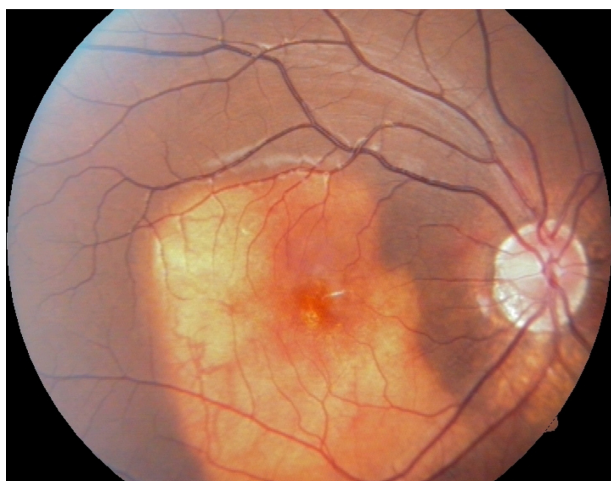
Figure 1 Fundus picture showing a typical orange-yellowish lesion.