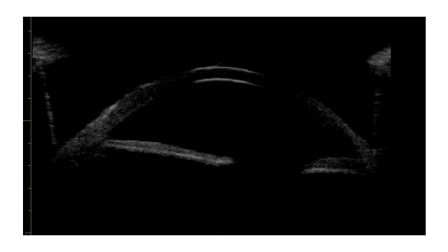
Figure 2 Ultrasound biomicroscopy showed absence of iridocorneal apposition.

The syndrome was first described in association with ICCE, but it has also been described after several types of lens surgery such as the extracapsular lens extraction,