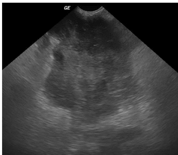
Figure 1 Transverse ultrasonographic view of the right liver of the dog, showing an extremely heterogeneous and irregularly margined liver.

The following day, the patient appeared to have increased respiratory effort and an additional 1,300 mL of serosanguineous fluid was removed via left-sided thoracocentesis. Recheck of ALT, total bilirubin, albumin, PCV, and total solids revealed an improving ALT of 509 U/L (reference interval 10–100 U/L), normal total bilirubin of 29.1 \mu\text{mol/L} (reference interval 0.0–8.6 \mu\text{mol/L} ), decreasing albumin of 19 g/L (reference interval 22–39 g/L), and total solids of 48 g/L, with a normal PCV of 39%. A complete abdominal ultrasound revealed less (unable to sample) peritoneal effusion with dilated hepatic veins and mild enlargement of the right liver lobe with hyperechoic mesentery (Figure 1). There was decreased blood flow to the right liver lobe using color flow Doppler evaluation. A right liver lobe torsion (LLT)