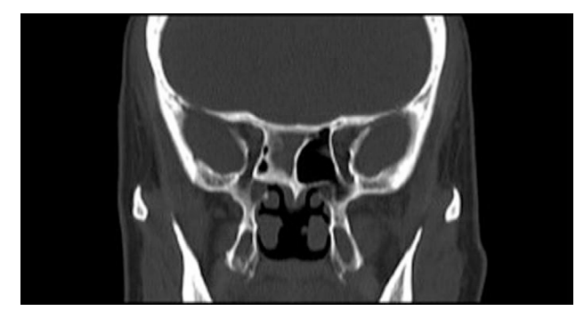
Figure 4 CT finding of fungal ball sphenoiditis.

Allergic fungal sinusitis (AFS) is another form of noninvasive fungal rhinosinusitis. Major criteria for diagnosis as