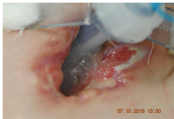
Figure 4 Before treatment.

Topline (Industrial Ltd, Stevenage Hertfordshire, UK) with multibeam laser probe with 18 diodes and radiation: red 685 nm/30–50 mW, infrared 830 nm/100–400 mW and combined until 1,800 mW. Treatment consisted of 9 sessions each lasting 2 minutes, focused on the wound area. Topical treatment included customized ointment composed of 85 g allantoin ointment 2 packages, panthenol spray 1/5 p, sol-coseryl dental 5 g, dexaven dental 5 g and metronidazole dental 5 g. It was a dose for 1 month treatment. Dressings were changed daily. Complementary treatment included Kinesiology taping (Nittodenko, Osaka Prefecture, Japan). Local treatment lasted 35 days with good results, and much improvement was observed during the course of the therapy. When the local effect was satisfactory and the wound almost completely healed, we discharged the patient out of the hospital and forwarded him to palliative care with home ventilator program. Local treatment with Kinesiology Taping and ointments was continued for next 4 months, with very good final – total wound healing and proper formal stoma and tracheocutaneous tract creation (Figures 4 and 5 present wound before and after the treatment).