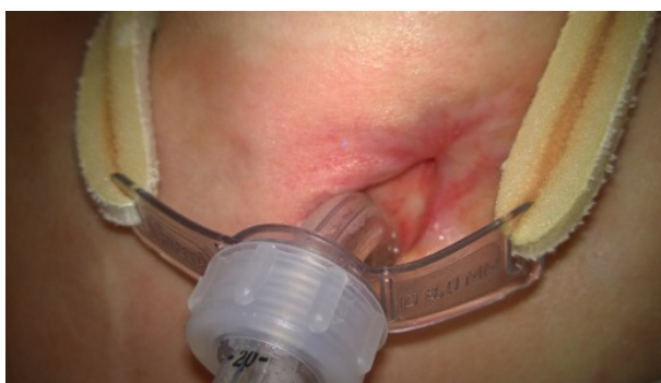
Figure 5 After local treatment.

Topline (Industrial Ltd, Stevenage Hertfordshire, UK) with multibeam laser probe with 18 diodes and radiation: red 685 nm/30–50 mW, infrared 830 nm/100–400 mW and combined until 1,800 mW. Treatment consisted of 9 sessions each lasting 2 minutes, focused on the wound area. Topical treatment included customized ointment composed of 85 g allantoin ointment 2 packages, panthenol spray 1/5 p, sol-coseryl dental 5 g, dexaven dental 5 g and metronidazole dental 5 g. It was a dose for 1 month treatment. Dressings were changed daily. Complementary treatment included Kinesiology taping (Nittodenko, Osaka Prefecture, Japan). Local treatment lasted 35 days with good results, and much improvement was observed during the course of the therapy. When the local effect was satisfactory and the wound almost completely healed, we discharged the patient out of the hospital and forwarded him to palliative care with home ventilator program. Local treatment with Kinesiology Taping and ointments was continued for next 4 months, with very good final – total wound healing and proper formal stoma and tracheocutaneous tract creation (Figures 4 and 5 present wound before and after the treatment).