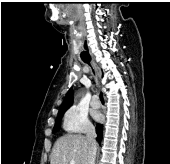
Figure 1 Computed tomography scan.