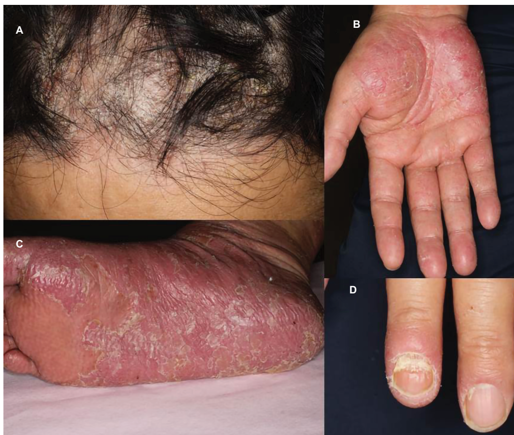
Figure 1 Psoriasiform skin lesions in the frontal scalp region (A), palms (B), soles (C), and fingernails (D).

where he was diagnosed with paradoxical psoriasis associated with infliximab use (Psoriasis Area Severity Index [PASI] 14.3), and treatment was started with a topical steroid and vitamin D 3 ointment. However, because of the poor response of the skin lesions to this treatment, infliximab was discontinued 3 months after the diagnosis of paradoxical psoriasis. However, the skin symptoms, while showing a tendency to abate, nevertheless persisted, with a PASI of 9.3. There was no relapse of the gastrointestinal symptoms. Eight months after the discontinuation of infliximab, the patient developed painful knee joint swelling (Figure 2A). The gastrointestinal symptoms still remained in remission. The CDAI was 122 and the serum CRP level was 0.67 mg/dL. Plain radiographs of the right knee revealed no abnormal findings. Although arthrocentesis was performed, no significant abnormalities were detected in the synovial fluid. Based on these findings, we diagnosed the patient with peripheral arthritis as an extraintestinal manifestation of Crohn's disease. Because the skin symptoms persisted, the patient was started on treatment with ustekinumab. Soon after the start of this treatment, the