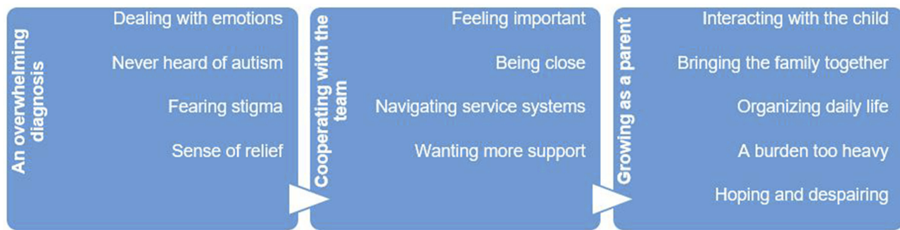
Figure 2 Presentation of the subthemes in each of the main themes.

the team. Taking an active part in the child's interventions was experienced as generating both emotional and practical consequences for the parents, which was interpreted as the third main theme, growing as a parent.