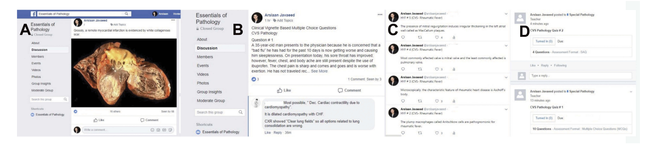
Figure 2 Educational content delivery through social medical platforms. (A) Shows gross image shared on Facebook. (B) Shows a scenario-based question shared on Facebook and the response of a student. (C) Shows a High Yield Facts tweeted on Twitter. (D) Shows a Quizzes posted on Edmodo.