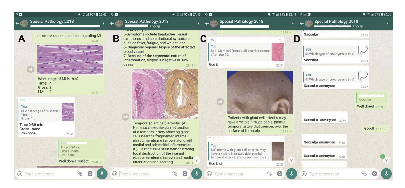
Figure I Educational content delivery through WhatsApp. (A) Shows response of a student on a microscopic image and feedback by the educator. (B) Shows another microscopic image and its features shared by the educator. (C) Shows a gross image. (D) Shows response of several students over a question.

Today's medical students have used social networking sites extensively as a communication tool throughout their teens and early adult personal, professional and educational lives. <sup>9</sup> Because the contents in social networking sites are user-