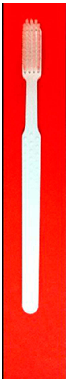
Figure 2 Manual reference toothbrush (ADA).

was based on a recording on all natural teeth with the exception of the third molars. The plaque index for the subject was obtained by adding together the indexes for all surfaces (labial and lingual) and dividing by the number of surfaces examined. The same scale was also used to score the 1 st and 2 nd molars.