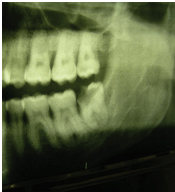
Figure 1 A) Emerging cutaneous sinus tract on the neck of case no. 1 patient. B) Panoramic radiograph demonstrating abscessed third molar.

The medical history was negative. The patient reported using a hot or warm washcloth on the left side of his face. Clinical examination revealed an area of firm swelling approximately 1 cm in diameter slightly superior to the middle of the left ramus of the mandible (Figure 3A). An intra-oral clinical examination revealed the presence of several severely carious teeth and root tips.