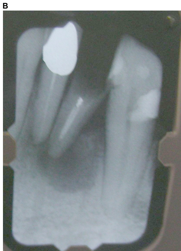
Figure 2 A) Cutaneous sinus tract on the chin of case no. 2 patient. B) Periapical radiograph demonstrating failing root canal therapy of mandibular anterior tooth.

The patient was referred to Oral and Maxillofacial Surgery for the extractions of the noted problematic teeth. The extraction procedures were routine and the patient was lost to follow-up.