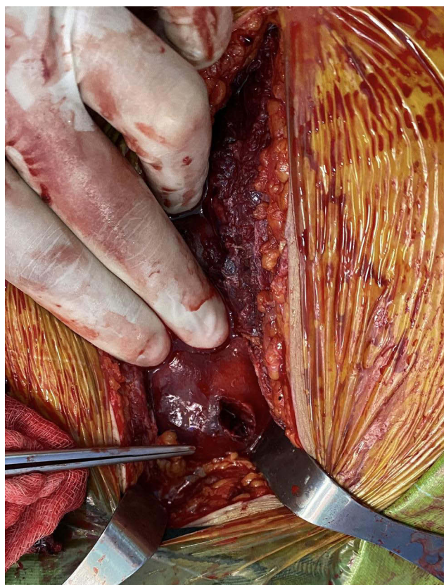
Figure 2 The wound was at the anterior lower pole.

creatinine. 5 However, Morgan (2019) performed a Doppler ultrasound of the transplanted kidney 10 min immediately after the biopsy procedure and then performed routine follow-up. 2