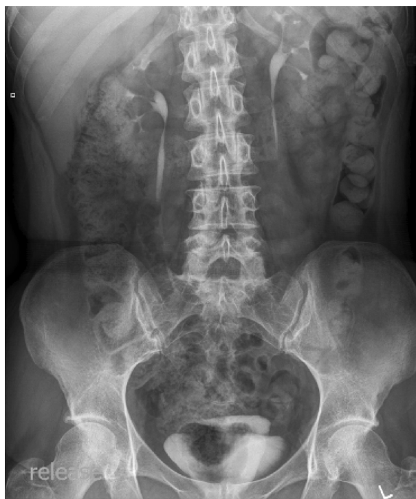
Figure 2 IVU showing normal upper tract with contrast in the urinary bladder and vagina simultaneously.

A classical transabdominal repair of the VVF was performed. The bladder was bivalved in the midline position, down to the level of the VVF. Both ureteric orifices were identified at the time of the procedure and were catheterized intraoperatively through the cystotomy incision (Figure 3).