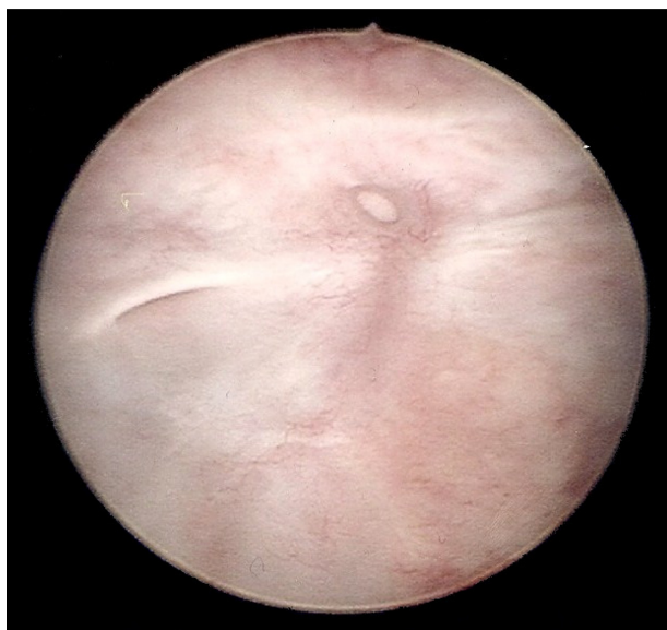
Figure 1 Cystoscopy image showing scarring around the right ureteric orifice and discrete fistula to centre of trigone.

The rate of successful fistula repair reported in the literature varies between 70% and 100% in nonradiated patients, with similar results when a vaginal or abdominal approach is performed, the mean success rates being 91% and 97%, respectively. Many institutions prefer to perform a urinary diversion. 1