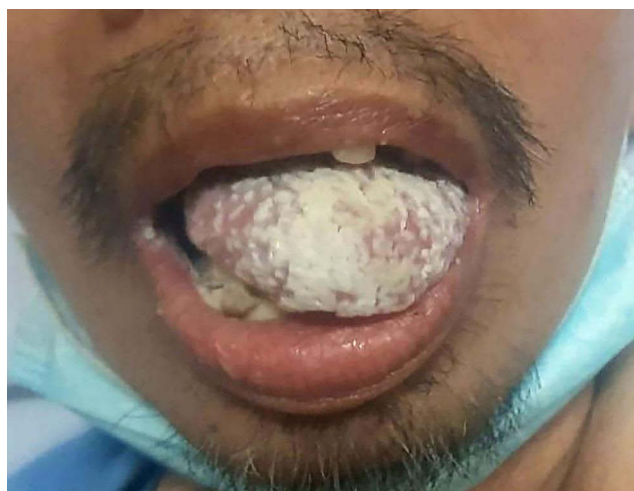
Figure 1 Whole of the intraoral mucosa and tongue surface covered by white plaque.

The management for this case from Department of Internal Medicine were given Co-Trimoxazole (Trimetropin/Sulfamethoxazole), Efavirenz/Emtricitabine, Tenofovir, Lovenox, Enoxaparin Sodium, Anticoagulant, Remdesivir, and Vitamin D 5000 IU. While the management provided by the Department of Oral Medicine were in form of education and