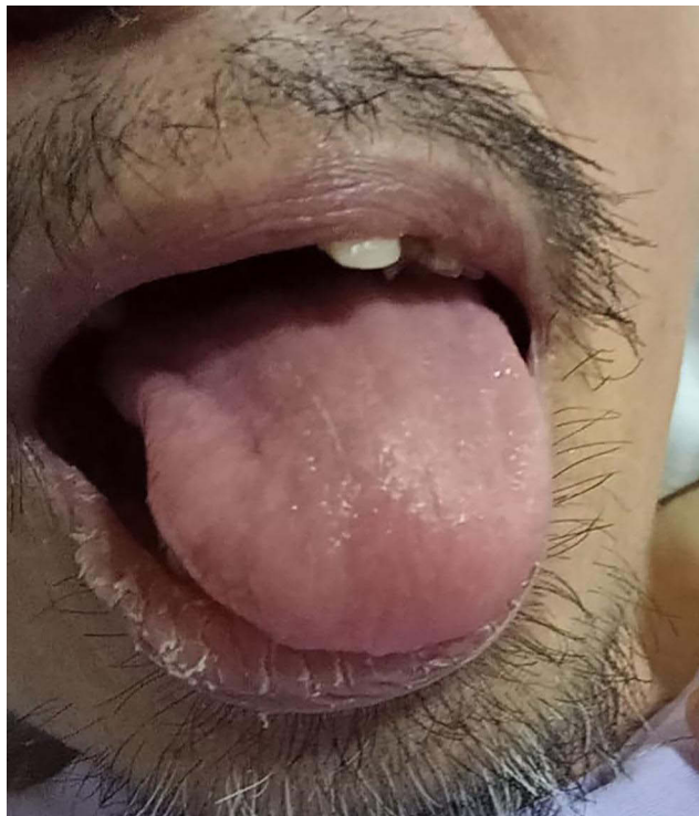
Figure 4 The disappearance of white plaque covering intraoral mucosa and the surface of the tongue patient.

Treatment and monitoring that is carried out periodically give the expected results. Chief complaints of pain and discomfort experienced by the patient and the white plaque that covers the patient's tongue were resolved completely. The good general condition of the patient makes the patient cooperative and supports the patient in carrying out the instructions given.