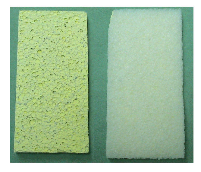
Figure I The yellow section represents the active part of TachoSil that has to be applied on to the liver surface.

TachoSil is a development of TachoComb<sup>®</sup> (Nycomed Linz, Austria) and TachoComb® H (Nycomed Linz, Austria). TachoComb is made with equine collagen, bovine thrombin, bovine aprotinin, and human fibrinogen. TachoComb H contains human thrombin in place of bovine thrombin. TachoSil contains only human fibrinogen with equine collagen as a carrier. It does not contain aprotinin or any other component of bovine origin. TachoSil works by mimicking the final steps of the natural blood-clotting process, creating a fibrin clot at the surgical site to achieve hemostasis in 3-5 minutes. TachoSil consists of a white collagen sponge coated on one side with fibrinogen and thrombin. Riboflavin gives a yellow appearance to the coated side (Figure 1). One of the most important achievements of TachoSil compared with its precursors is the possibility of storage at room temperature, avoiding the necessity of refrigeration or freezing. The product is ready to use, which represents an advantage when it has to be used quickly.