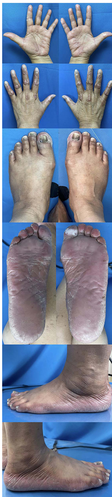
Figure 1 Clinical image of erythematous plaques with scales on the palms and soles accompanied with knuckle pads on the back of the hands before treatment.

hormone examination results were within normal limits, and the antinuclear antibody was nonreactive. Histopathological examination revealed that the epidermis was covered with stratified squamous epithelium, with hyperkeratosis, orthokeratosis, and acanthosis. The dermis consists of stromal connective tissue covered with perivascular lymphocytic