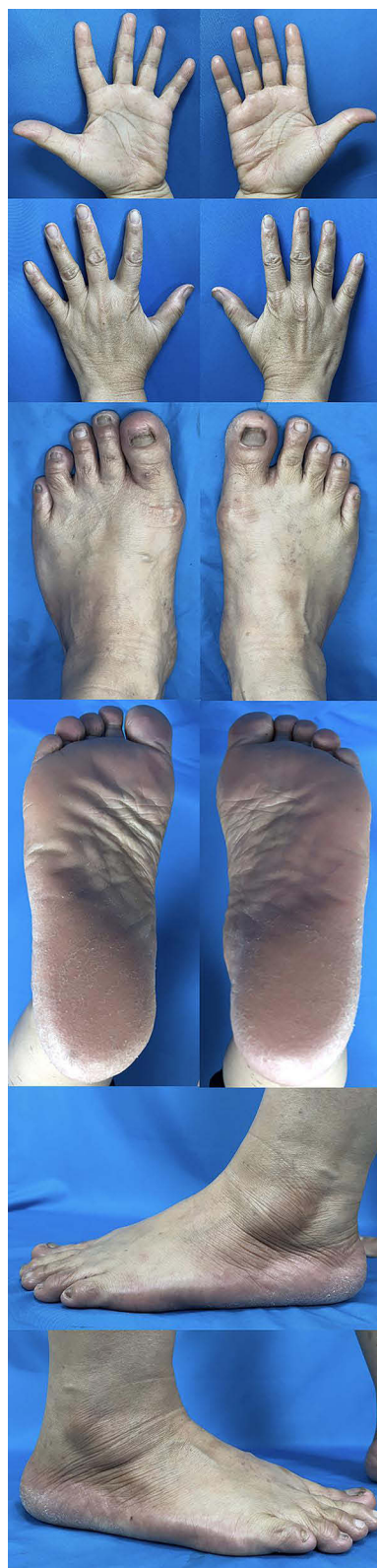
Figure 3 Improvement of skin lesions after capecitabine was discontinued.

supporting theory is that microtrauma to the capillaries due to mechanical stress can cause chemotherapy agents to escape from the blood vessels and cause cytotoxic effects on the surrounding tissues. 6 Capecitabine has also been reported to cause a variety of dermatologic reaction, such as lichenoid drug eruption, 7 leukocytoclastic vasculitis, 8 skin