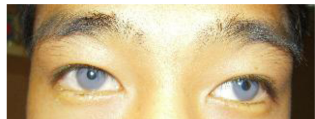
Figure 2 Patient with blue NewColorIris implants OU. Note the temporal displacement of the left implant with a decentered light reflex.

Steps should be taken to select appropriate candidates for artificial iris implantation. Currently, no criteria for candidacy have been established. While anterior chamber depth and baseline endothelial cell density should be evaluated, close attention must be given to the dimensions of the cornea at the limbus. Given the asymmetry of the horizontal and vertical meridians of the cornea, the anterior chamber would not uniformly support a perfectly circular implant. Furthermore, a detailed and careful evaluation of