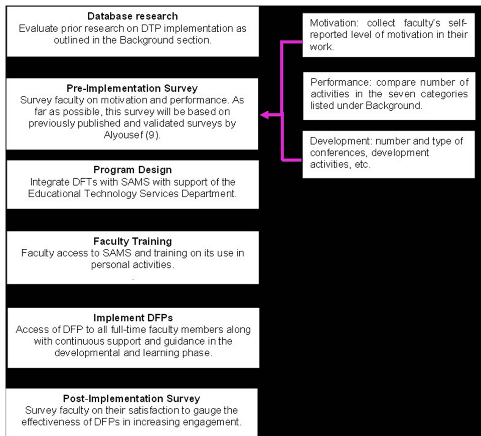
Figure 1 The DFP flow chart of design and implementation phases.

Based on the analysis of various approaches, expert opinion, and literature, we concluded that the domains of a faculty member's DFP should include elements indicating their professional growth: general knowledge, scientific and technological activity, instructional approaches, and key aspects that the teacher uses and expands. As a result, we