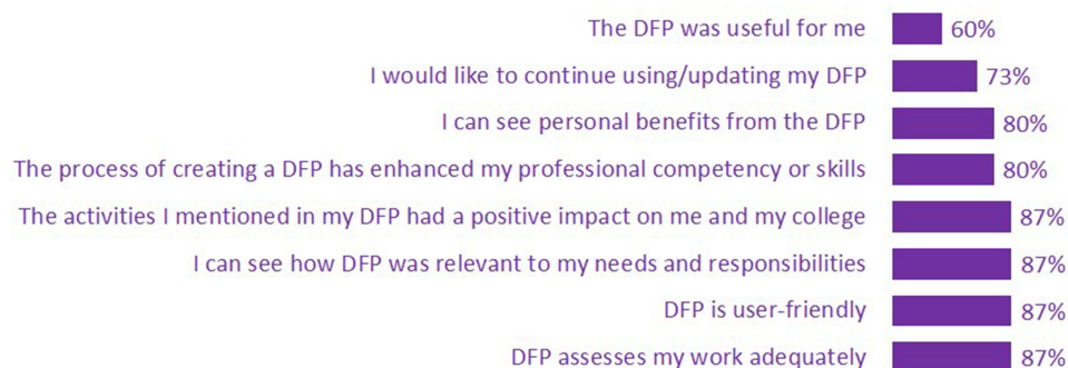
Figure 2 User's Guide.

This report focuses on stages 1 (needs assessment) and 6 (evaluation) since these stages produced quantitative results suitable to the format.