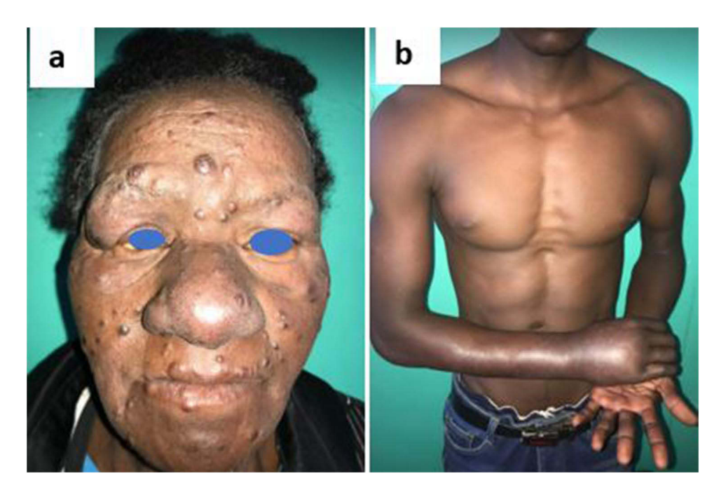
Figure I (a) Lepromatous leprosy with diffused papulonodular skin-colored lesions on the face; (b) neuritis.