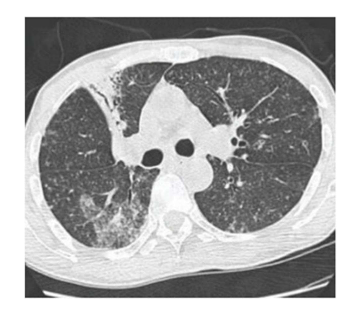
Figure 4 Chest tomography showing alveolar-interstitial opacities in the left lower lobe.

association of pulmonary tuberculosis and lepromatous leprosy in Madagascar.<sup>10</sup> There is a worldwide decline in the number of co-infections of leprosy and tuberculosis in the modern era, which may be explained by the high prevalence of BCG vaccination coverage.<sup>11</sup>