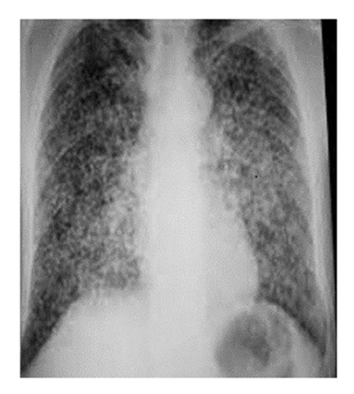
Figure 3 Chest X-ray showing numerous small nodular opacities scattered throughout the lungs.

Leprosy and tuberculosis have been prevalent worldwide for over a century. They constitute a global health issue despite advancement of medical research and the success of MDT by the WHO.<sup>6</sup> Coinfection with Mycobacterium leprae and Mycobacterium tuberculosis is rarely reported and varies from 2.5 to 7.7% in India.<sup>7,8</sup> Coinfection of leprosy and tuberculosis are not uncommon, though infrequently reported.<sup>5</sup> In the recent literature, the new cases detection of the coinfection was 0.02 per 100,000 inhabitant per year worldwide, and was estimated to 2–6 new cases per 100,000 in Madagascar.<sup>9,10</sup> Both leprosy and tuberculosis remain endemic in Madagascar, and previous study reported 8 per 100 000 new tuberculosis cases per year. However, there are few reports on dual mycobacterial infections in Madagascar. Sendrasoa et al reported in 2015, the first and only documented case of