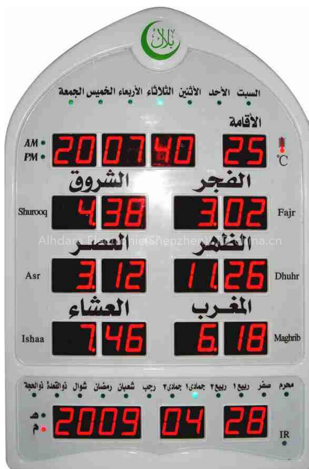
Figure 2 Electronic clocks have been used recently in mosques to determine prayer times.

sleep or doze off, His creations, including mankind, need sleep every day.