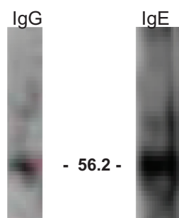
Figure 2 Immunoblot analysis of IgG and IgE anti-H1N1 virus antibodies.

Notes: Serum from subjects with a past history of influenza virus vaccination and H1N1 infection, influenza virus vaccine and no H1N1 infection, or unvaccinated and uninfected controls was incubated with nitrocellulose strips containing H1N1 virus vaccine antigen (see Materials and methods section). IgG (left panel) representative blot of subject vaccinated with influenza virus vaccine, and infected with H1N1 virus; development time, 10 seconds. IgE (right panel), representative blot of subject vaccinated with influenza virus vaccine and infected with H1N1 virus; development time, 7 seconds. Data represent one of two patients with similar results.