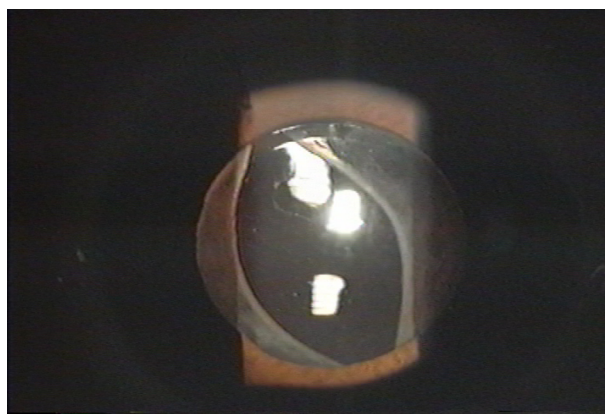
Figure 2 Slit-lamp photograph at 12 months postoperatively.

Traditional pars plana lensectomy involves removing both the anterior and posterior capsule along with the crystalline lens to prevent later development of anterior capsular opacity. An anterior chamber IOL or scleral sutured posterior chamber