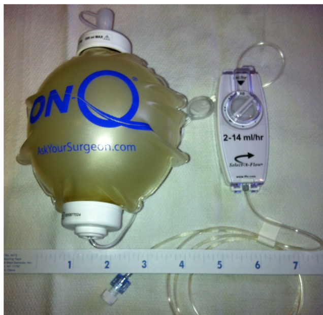
Figure 1 ON-Q Pain Buster® Post-op Pain Relief System (I-Flow Corporation, Lake Forest, CA).

We conducted a randomized, multicenter, pilot study in women following open gynecological surgery to compare