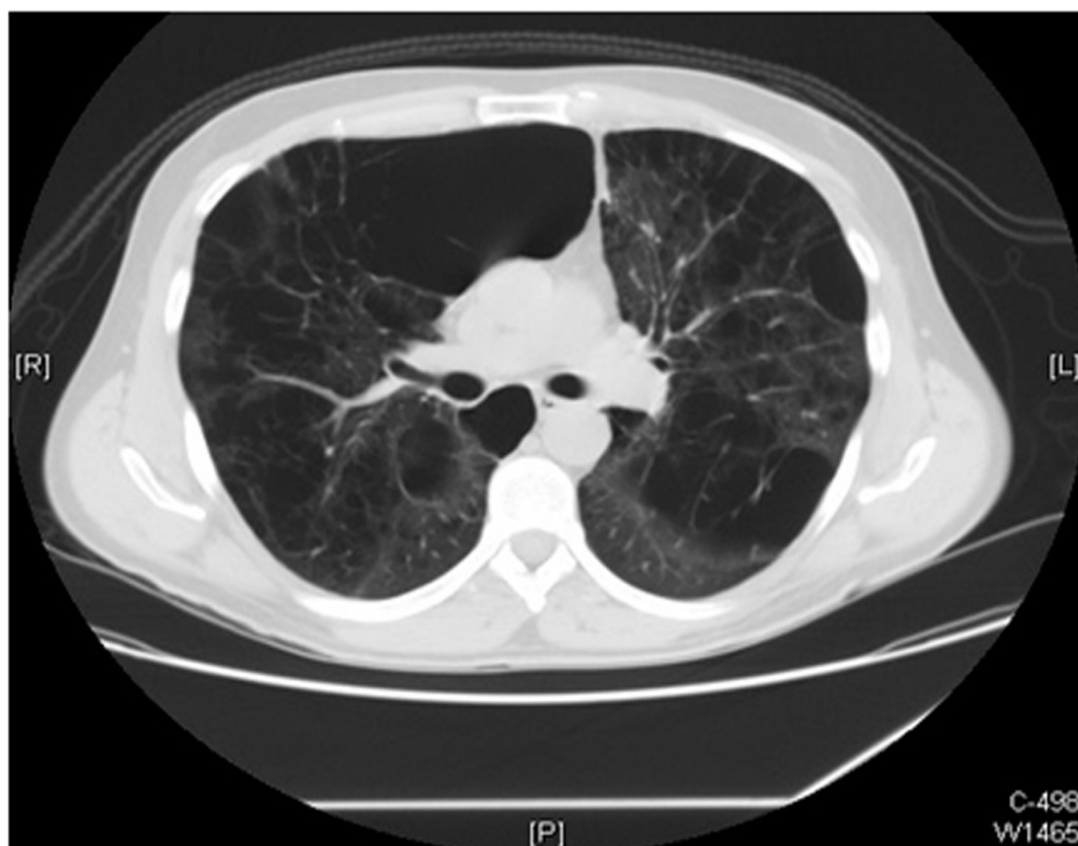
Figure 1 Panlobular emphysema with multiple bullas.