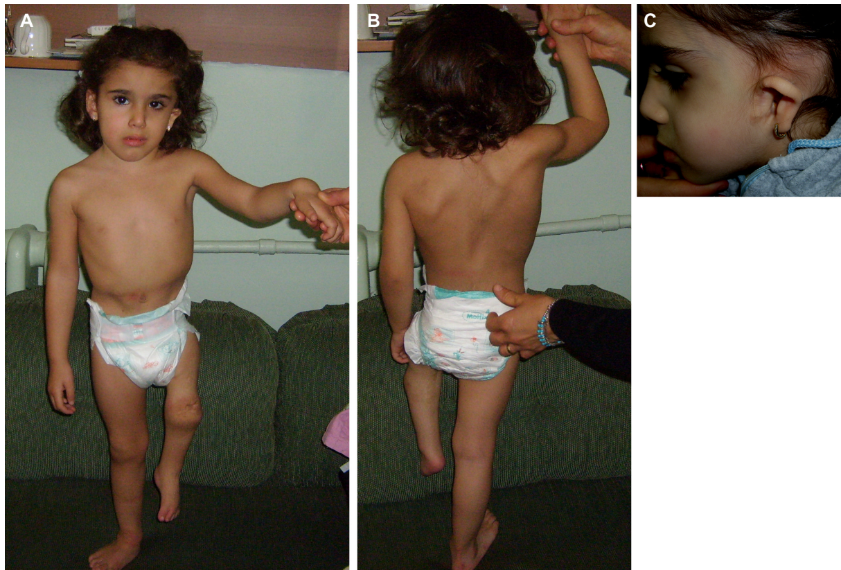
Figure 1 (A) Front view of the patient, showing facial asymmetry, pes equinovarus on the left side, a 90 degree flexion contracture of the left knee, and marked shortness of the lower limb. Hypoplasia of the muscles and subcutaneous fat in the stylopod with overt reduction of the limb circumference were also noted. (B) Back view of the patient, showing scoliosis and tethered cord. (C) A low-set left ear and atretic pinna (left microtia).

The patient and her family were referred to the Department of Medical Genetics. The girl had a normal female karyotype (46, XX) in cultured blood lymphocytes. Her chromosomal analysis, based on 400–550 bands per haploid karyotype, did not reveal any abnormalities. There was no family history of eye or genetic defects, and her