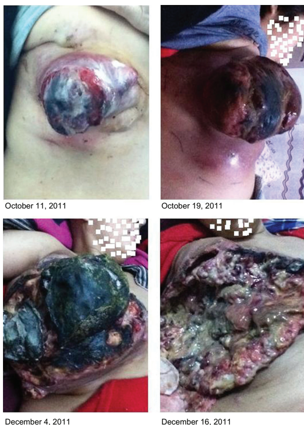
Figure 4 Tumor images after surgery.

Some tumors can be distinguished from MFH, including malignant phyllodes tumors, malignant myoepithelioma, and myofibroblastic tumors. 10-14 The intercellular substances of the malignant phyllodes tumors usually have fibrosarcoma-like changes with bidirectional differentiation. The structure