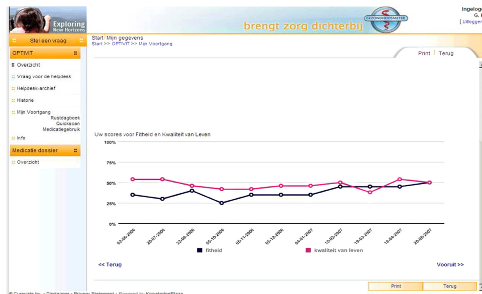
Figure 2 Screenshot of graphic feedback of changes in fitness score (black line) and quality of life score (red line).

Completion-adherent patients who had completed the study within 30 days after the scheduled T12 date were classified as interval adherent.