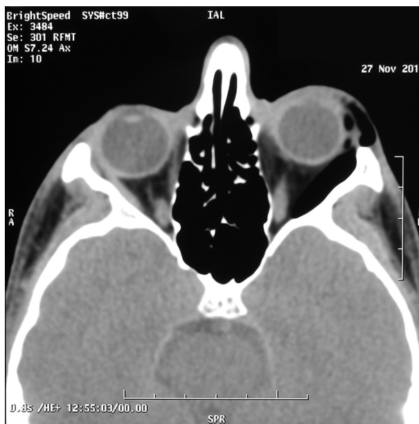
Figure 2 Left lower lid subcutaneous emphysema, lateral subconjunctival emphysema, and orbital emphysema.

Orbital emphysema most often results from a fracture of the orbital wall that allows air to enter the orbit from the paranasal sinuses. 5 The presence of orbital, subconjunctival, and subcutaneous emphysema may be due to air from the nasal cavity entering between the loose tissue planes of the orbit after fractures of the orbital walls. 3 Subconjunctival emphysema can be explained by probable communication between the subcutaneous and subconjunctival planes 6 or the probable