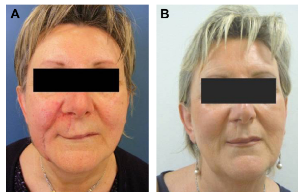
Figure 2 Pre- and post-treatment comparative images.

CMC promoted a significant improvement both in patients' physical appearance and in their self-image and perceived social role due to disguising of body disfigurement. Before treatment, patients had poor self-image and overwhelming social withdrawal induced by the physical illness. The group of patients undergoing CMC experienced a strong recovery of their self-image, with significant improvement of all the vital functional parameters, and self-satisfaction. Their physical appearance no longer gave rise to negative emotions, but instead inspired the patients to take more care of themselves, coupled with feelings of being accepted within social interactions. We believe that CMC could shift patients' attention from their continuously perceived illness to a more positive attitude, where their perceived self-image is fully and harmoniously reintegrated into their emotional life. A key role in recovering such a psychological balance is played out by the close interaction between the desire for improved appearance and improved social relationships. This was demonstrated by the significant reduction of the patient's compulsive control of their physical appearance and the increase of the work related satisfaction.