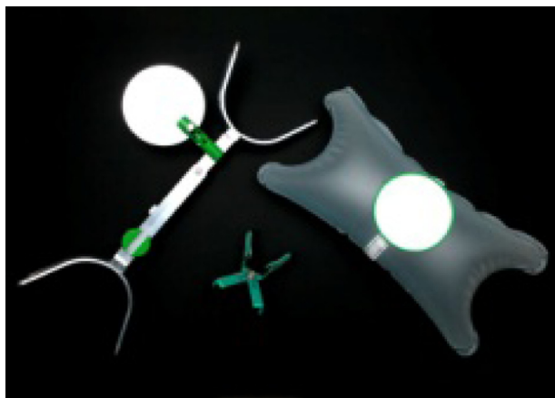
Figure 2 Appliances available to help facilitate clean intermittent self-catheterization. Note: Shown are thigh abductors, mirrors, and labial spreaders.

Lack of proper training was cited as a barrier to CISC in 5% of patients in one study, 18 which highlights the importance