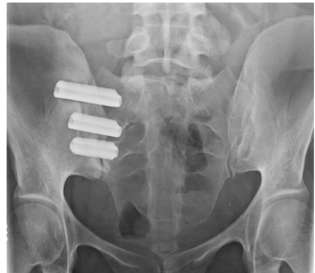
Figure 2 Postoperative radiograph demonstrating placement of three fusion implants across the sacroiliac joint.

Note: The 'L' represents the patient's left.