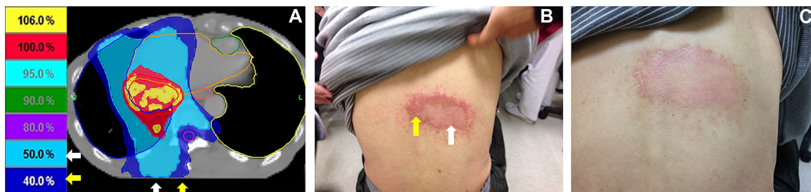
Figure 1 The correlation in radiation dose and recall radiation dermatitis that followed sorafenib prescription.

Notes: (A) Forty-eight Gy, in six fractions, was delivered by HT liver SBRT. The red area received 100%, the light-blue area received 50%, and the navy-blue area received 40% of the prescribed dose. (B) The photograph of the dermatitis that followed sorafenib prescription shows that it correlated with off-target dose area. (C) The photograph shows the recovered dermatitis after medical management. The white arrow shows the area that received 50% of the prescribed dose; the yellow arrow shows the area that received 40% of the prescribed dose.