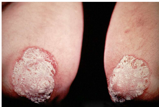
Figure 1 Clinical presentation of plaque-type psoriasis demonstrating well demarcated erythematous plaques with overlying adherent scale.