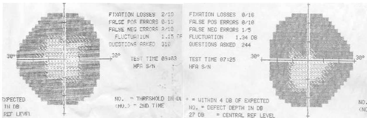
Figure 1 Humphrey Field Analyzer of patient shows concentric visual field defect.

Retinopathy of varying severity is present in a majority of pre-eclamptic patients (Sunness 1988). Although statistically significant differences in retinal arterial caliber and number of focal constricted areas are observed in women who had mild and severe pre-eclampsia. The earliest fundus manifestations include reversible focal arteriolar spasm (Albert and Dryja 1989). Arteriolar narrowing and focal arteriolar constrictions have been loosely correlated with the diastolic blood pressure (Jaffe and Schatz 1987). Sometimes there are associated intraretinal hemorrhages, exudates, and nerve fiber layer infarcts (Jaffe and Schatz 1987). Disc edema evolves with the onset of malignant hypertension.