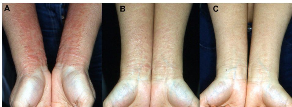
Figure 4 An example of typical demarcation around the wrists seen in the rebound eruption.

Although the addicted skin before withdrawal may have an atrophic appearance (sometimes the skin is thin and pale similar to paper), after withdrawal, the skin temporarily becomes extraordinarily thickened. Our most intuitive description of addicted skin is, the lesions of TSA look similar to those of atopic dermatitis, but there is something different or extraordinary regarding them.