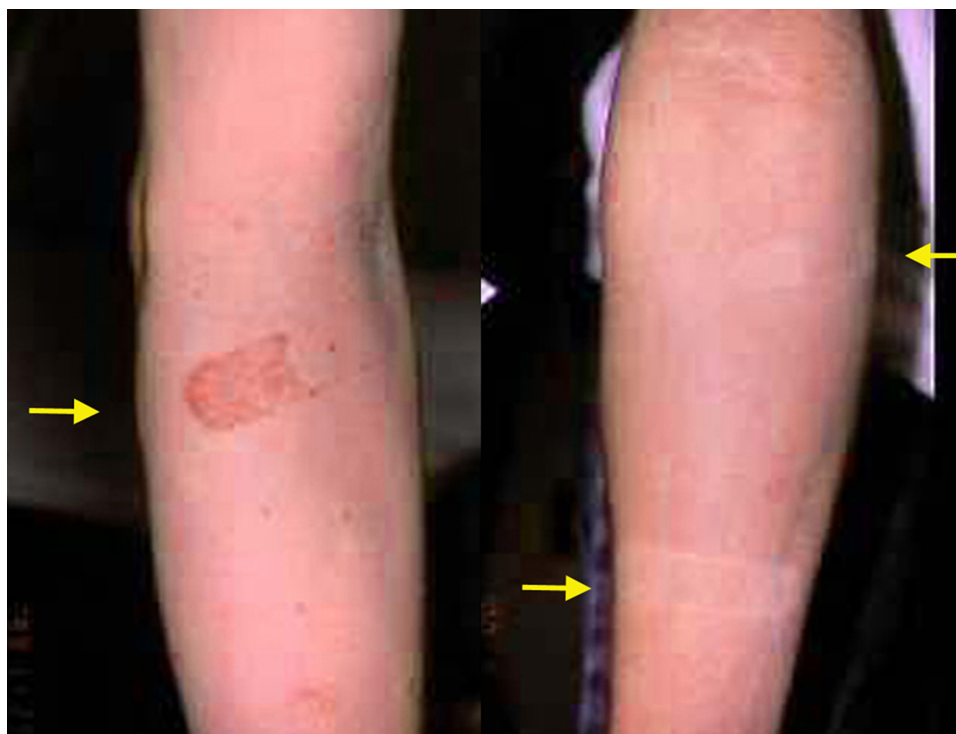
Figure 3 A case presenting hypersensitivity after topical steroid withdrawal.

Note: The skin where a band-aid was placed and detached (yellow arrows) shows an irritated appearance in the left photo, while almost normal after 1 year (right).