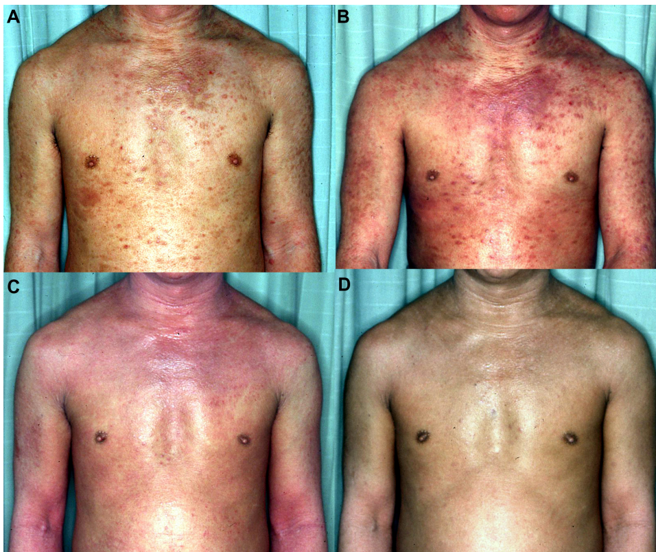
Figure 1 (A) A typical appearance of TSA, with prurigo-like eruption before withdrawal. (B) Appearance just after trial of decreasing the amount of potent topical steroids. The severity of addiction is so intense that the patient cannot safely withdraw by a gradual-decrease method. (C) The rebound erythema is spreading after complete cessation of steroids. (D) The appearance after 1 year. The rebound has almost subsided but hypersensitivity still remains. Abbreviation: TSA, topical steroid addiction.