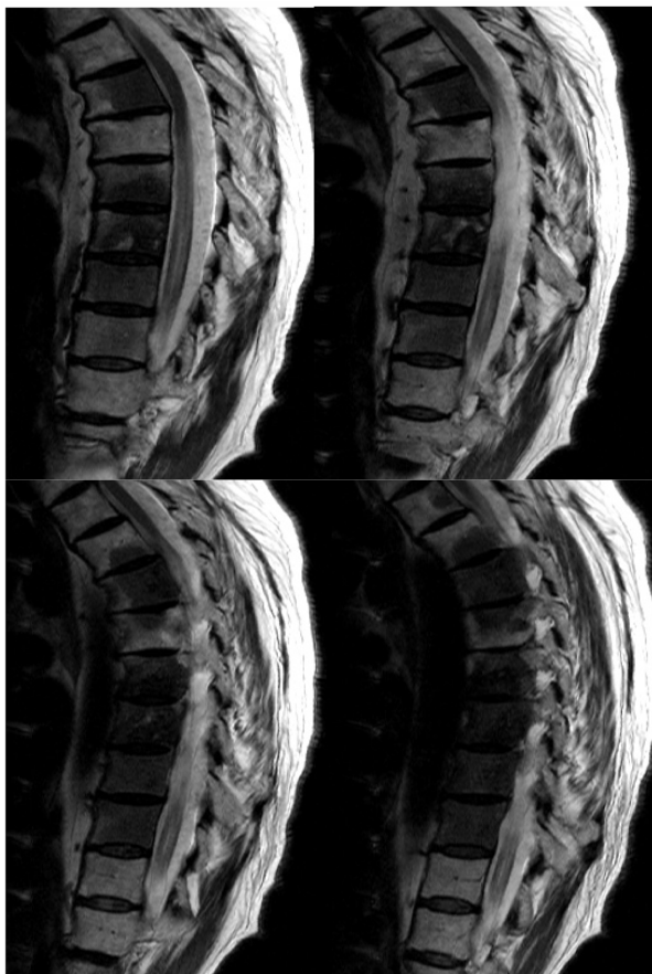
Figure 2 Magnetic resonance images of the thoracic spine, sagittal view, different sections, showing the thoracic body involvement.

Note: Extensive metastatic disease of the vertebral body can be seen.