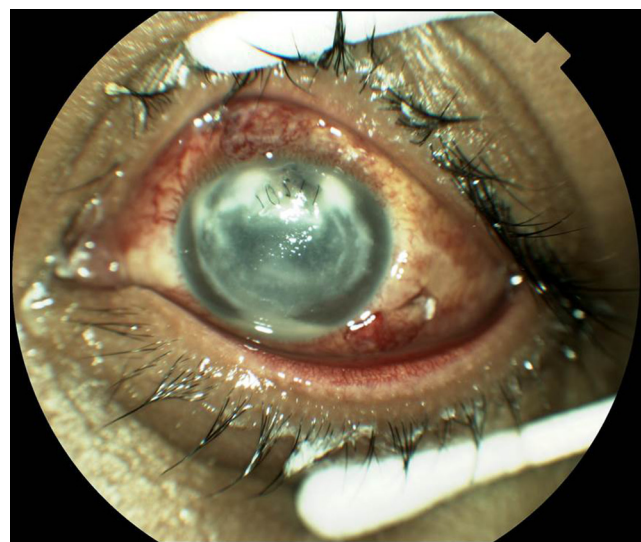
Figure 5 Posttraumatic endophthalmitis (note the sutured corneal wound and hypopyon).

Many predisposing factors have been associated with the development of endophthalmitis following open-globe injuries. These include IOFB, traumatic lens rupture, corneal wound, retinal break/detachment, traumatic cataract/posterior lens rupture, dirty wound, long hospital stay, and rural location. 94,95,98,100,101 Delayed wound closure and primary repair (beyond 12–24 hours) have also been reported as important risk factors. 95,96,106,107 Tissue prolapse