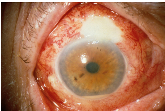
Figure 3 Bleb-related endophthalmitis (note the purulent filtering bleb and hypopyon).

Noninfectious endophthalmitis may occur following intravitreal injections. The etiology is poorly understood but may represent an inflammatory reaction to a component in the