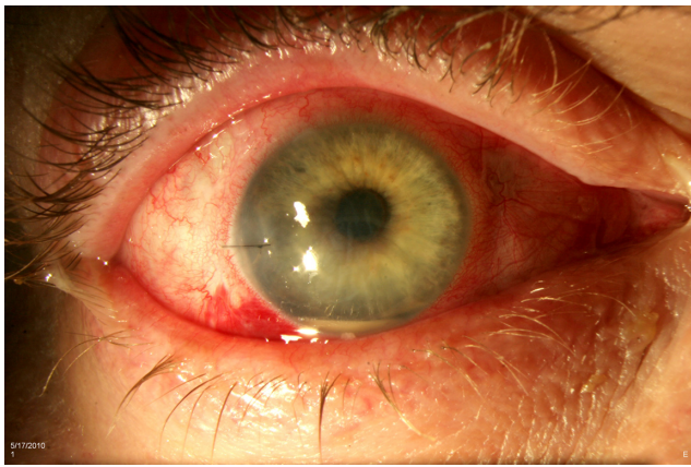
Figure 1 Acute-onset postoperative endophthalmitis (note the sutured corneal wound and hypopyon).

range from 0% to 2.4% for 20 G surgeries (with most rates falling between 0.02% and 0.05%) and 0%–1.3% following 23 G and 25 G PPV. 18–23