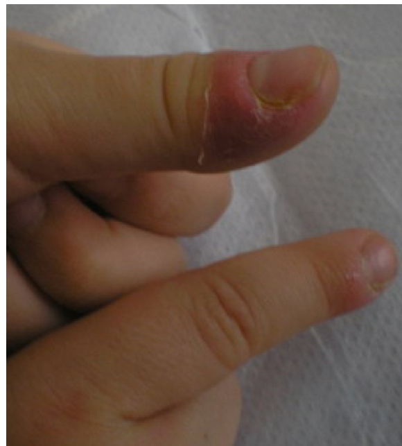
Figure 8 Onychophagia affecting the right hand and onychotillomania affecting the left thumb.

Psychodermatology is an expression of the interaction between skin and mind. It is of paramount importance for the clinician to establish an appropriate physician-patient-family relationship in order to diagnose and treat factitial skin diseases. Clues to the clinical diagnosis include bizarre, linear, or geometric features on accessible parts of the body, ambiguous history of lesions that are done by the patient for public eye. Skin injuries can be found on locations easily accessible for self-injury, ie, the face, trunk, and extremities.