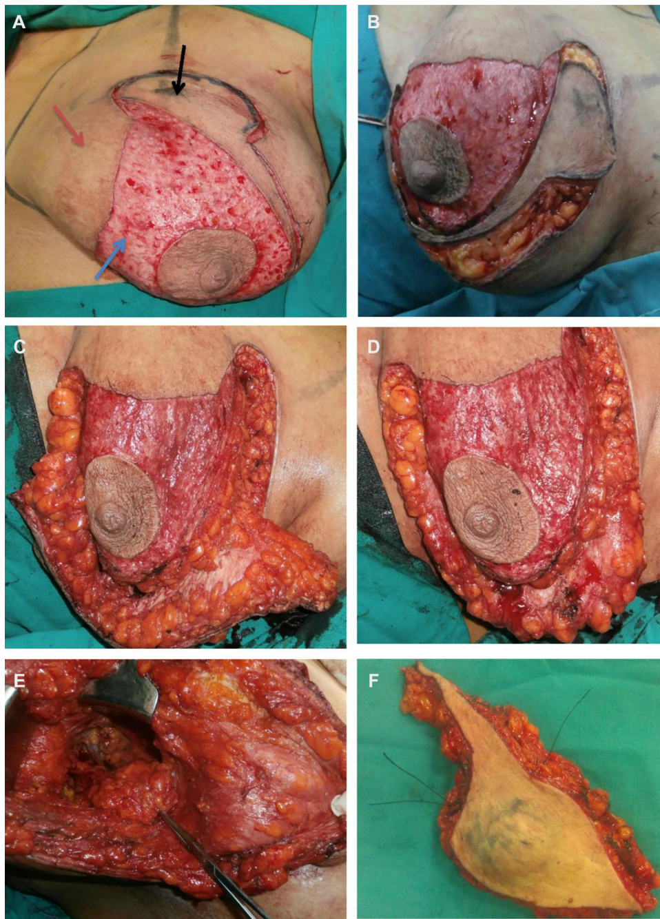
Figure 2 Tumor resection after deepithelialization.

Notes: (A) Deepithelialization of the distal half of the pedicle; black arrow points to the part to be resected; red arrow points to the intact part of the pedicle; blue arrow points to the deepithelialized part of the pedicle; (B and C) excision of the tumor-bearing area; (D) appearance after removal of the tumor-bearing area; (E) axillary dissection from the same wound; (F) specimen containing the tumor.