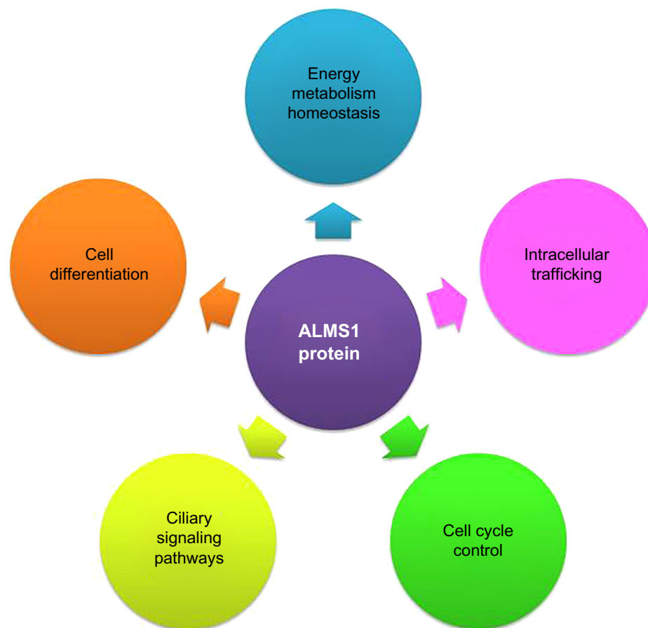
Figure 2 Schematic view of biological functions presumably related to ALMS1 protein until now.

Bbs4 knockout mice models, suggesting different roles for BBS and ALMS1 proteins. 39