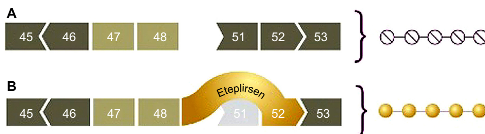
Figure 2 Mechanism of exon 51 skipping in the dystrophin gene.

An alternative approach to increasing production of dystrophin in muscle is exon skipping. 32 This approach involves anti-sense oligonucleotide (AON) drugs that are able to bind specifically to dystrophin RNA while it is being transcribed and processed/spliced (see Figure 2). Exon skipping has emerged as a promising therapeutic approach for DMD. The general strategy is to introduce an AON molecule that pairs with a target sequence in the pre-mRNA for dystrophin. This pairing causes the nuclear splicing machinery to skip over the target sequence, thereby excluding one or more mutation-bearing exons that would prevent production of the dystrophin protein. The end result is a shorter but still functional dystrophin molecule.