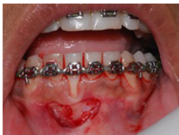
Figure 4 Lower arch vestibuloplasty.

was placed. The patient has been under regular follow-up for the last 18 months and there has been no sign of attachment loss.