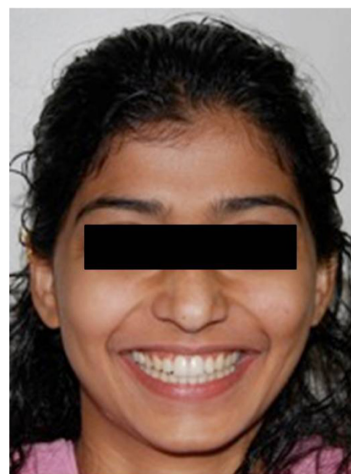
Figure 6 Post-treatment frontal smile photograph.

clined mandibular incisors and a mesial basal relationship of the jaws.