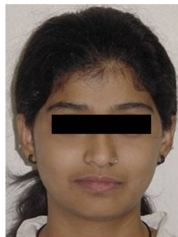
Figure 1 Pre-treatment frontal at rest.