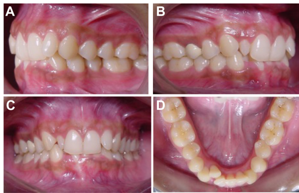
Figure 2 Pre-treatment intraoral photographs.

Notes: (A) Buccal left, (B) buccal right, (C) anterior view, (D) mandibular occlusal.