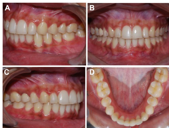
Figure 7 Post-treatment intraoral photographs.

In the present case report the alveolar bone covering the lower right central incisor was thin both on inspection and palpation. Hence the option of full thickness graft was kept open from the initial phase of diagnosis and treatment planning.